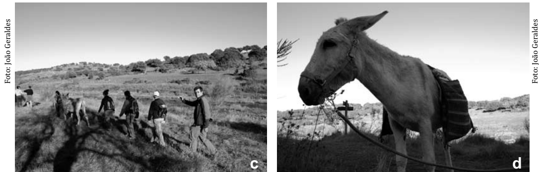
FIGURE 2: “Casa do Forno”. a – Trilobite’s cookies, b - Slices of Earth (tectonic pizzas), c - pedestrian trails, d - live reconstitutions.

Another revolutionary concept concerning GeoMarketing was the company Trilobite.Aventura (meaning Trilobite.Adventure) with outdoor activities, such as pedestrianism, slide, rappel, climbing, in the quartzite rocks with fossils from Penha Garcia. An innovative Geoproduct was the paintball championship – TriloPaint. This common outdoor activity was adopted and transformed in a typical product from the Geopark. Trilobite.Aventura also manages a bar located near the Fossils Trail, in a traditional quartzite building in the medieval core of Penha Garcia village. In February 2009 the company celebrated its first anniversary with a GeoCake illustrating the suggestive logo of Trilobite.Aventura. This trilobite-moving based on the outstanding trilobite trace fossils from the Ichnological park of Penha Garcia was transformed in logo and is always present in the trilobite team uniform (Fig. 3) and company’s image.