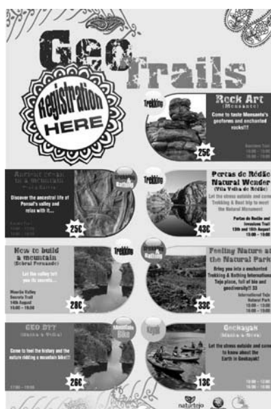
FIGURE 6: GeoTrails created for the BOOM Festival 2008.

Naturtejo encourages new projects in the territory and promote them in its activities. This is as long-term project and very innovative because the geological features that have been always present in the region for the local people now can be economically exploited through new opportunities for business and sustainable explored for the benefit of people .