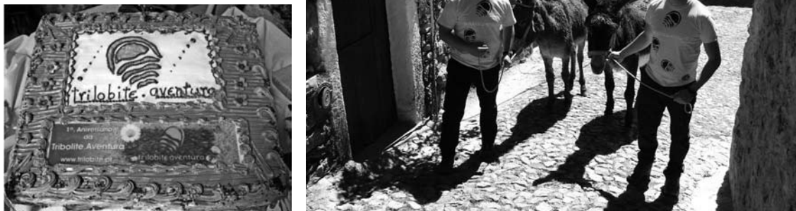
FIGURE 3: a - Trilobite.Aventura anniversary cake, b - The Trilobites’ uniform

Another revolutionary concept concerning GeoMarketing was the company Trilobite.Aventura (meaning Trilobite.Adventure) with outdoor activities, such as pedestrianism, slide, rappel, climbing, in the quartzite rocks with fossils from Penha Garcia. An innovative Geoproduct was the paintball championship – TriloPaint. This common outdoor activity was adopted and transformed in a typical product from the Geopark. Trilobite.Aventura also manages a bar located near the Fossils Trail, in a traditional quartzite building in the medieval core of Penha Garcia village. In February 2009 the company celebrated its first anniversary with a GeoCake illustrating the suggestive logo of Trilobite.Aventura. This trilobite-moving based on the outstanding trilobite trace fossils from the Ichnological park of Penha Garcia was transformed in logo and is always present in the trilobite team uniform (Fig. 3) and company’s image.