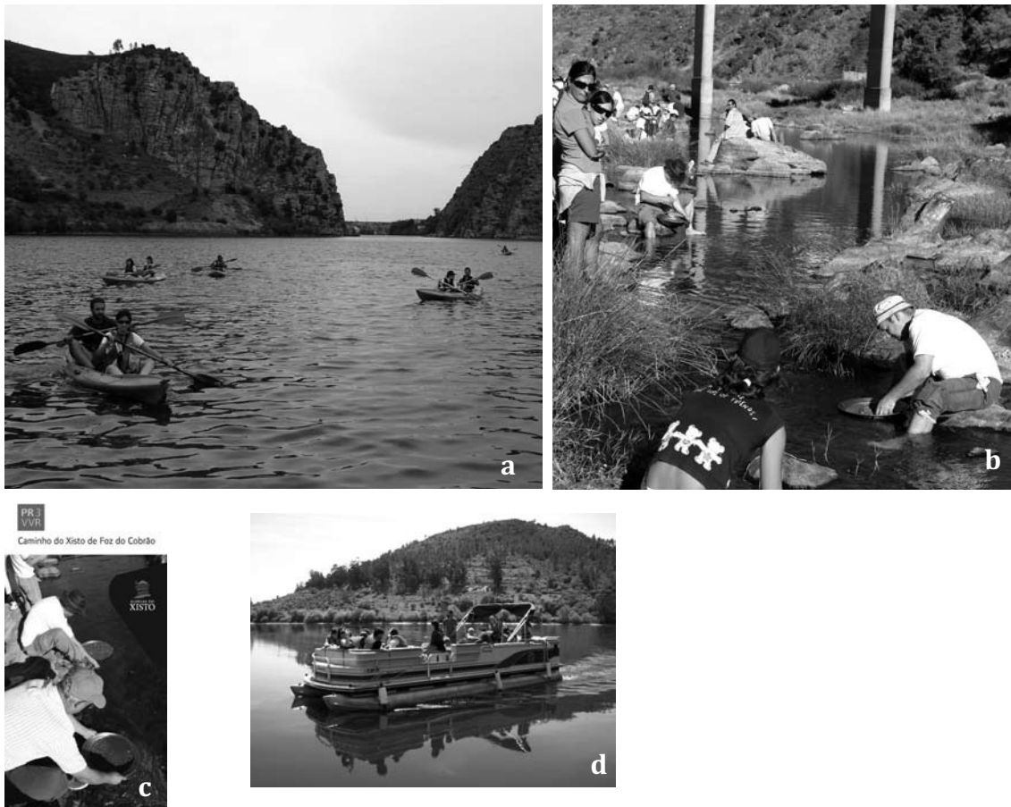
FIGURE 4: Incentivos Outdoor activities. a - GeoKayak, b - “There is gold at the Foz!”, c - Pedestrian Trails leaflet for GeoTrekking, d - boat trip in the Portas de Ródão Natural Monument.

It is an outdoor company which runs the boat trips to the Portas de Ródão Natural Monument and the Neolithic Tejo Rock Art. This visit along the quartzite crests and deeply-incised Tejo valley meets not only the Geodiversity but also the important avifauna, the historical and archaeological heritage. Besides these traditional boat trips Incentivos Outdoor also endorses GeoKayak in Portas de Ródão, in the Tejo River, but also in the Zêzere River meanders. In Foz do Cobreão Schist Village the company promotes a panning for gold activity with the local community. This activity called “There is gold at the Foz!” recreates the gold mining activity coming from Roman times until the the 1 st half of the 20 th century. The visitors are invited to take off the shoes, enter in the river and look for gold nuggets. In this village, the company runs a restaurant, in a traditional schist building with tasty traditional food and local products. Incentivos Outdoor presents also GeoTrekking and GeoCircuitos (GeoTrails) Programmes.