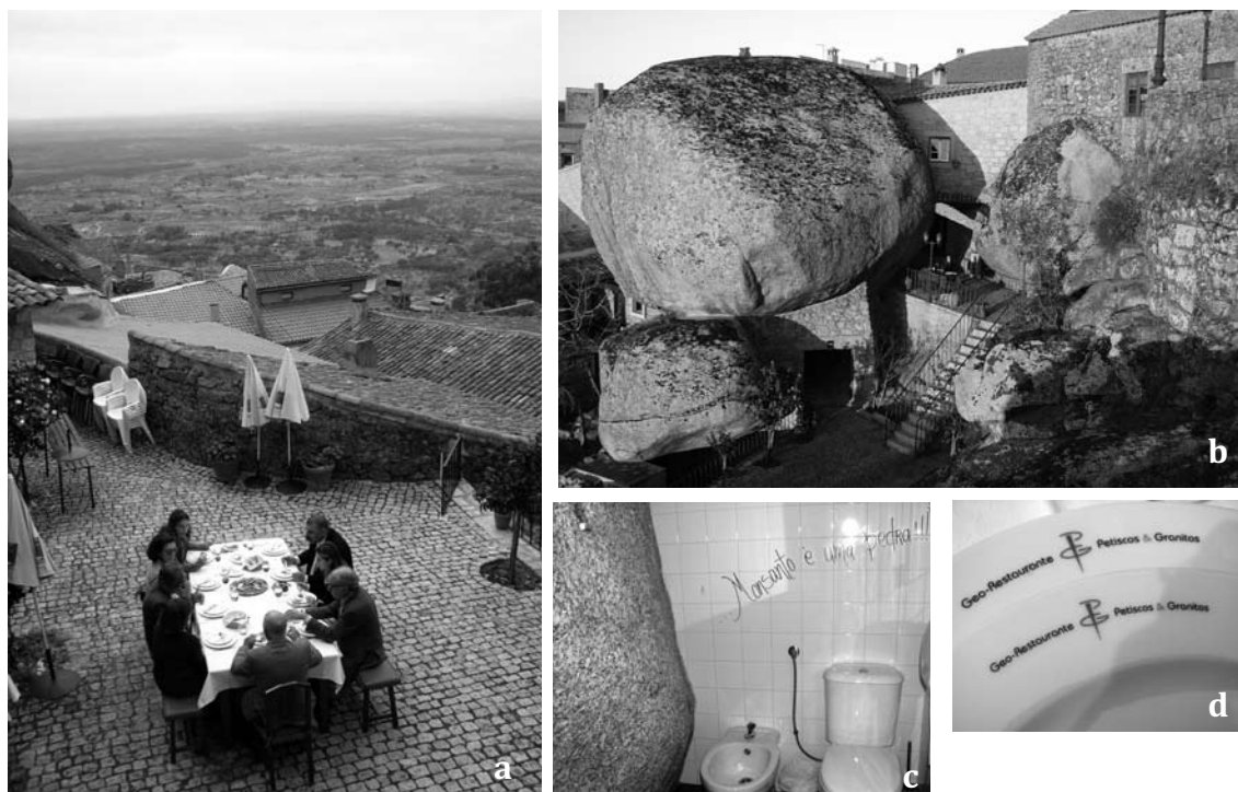
FIGURE 1: GeoRestaurant “Petiscos & Granitos”. a - Balcony over the Geopark landscape, b - terrace and “cave”, c - Geo Bathroom, d - GeoRestaurant dishes.

Almost in the extreme of the Geopark there is Casa do Forno, a GeoBakery and guest house, perhaps the first in the world (Fig.2). The GeoBakery has a very busy traditional oven that cooks besides traditional bread, Trilobite and Granulite cookies. After seeing the fossils in their context in the Geopark trails, why not taste them? But to understand the geological history of the territory, Casa do Forno suggests “The Slices of Earth” (tectonic pizzas on the plate) and Orogenic toasts for all the Geopark episodes (Cadomian, Variscan and Alpine). Casa do Forno, the guest house, offers not only comfort and rest but also geotourist activities, such as water trails, mining routes and reconstitutions of the traditional episodes, such as the smugglers route made by the Portuguese for centuries by crossing the Erges River. Here it is possible to have a delicious GeoDinner where you can start with Salted Schist’s and finish with egg cream Cliffs.